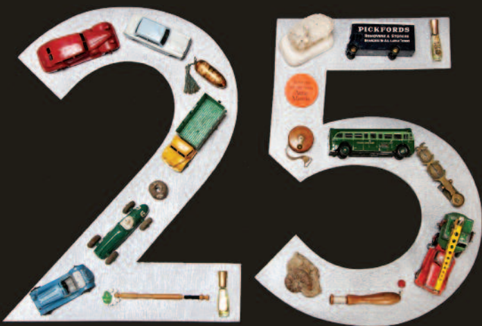
Cover: Objects that represent the museum collection